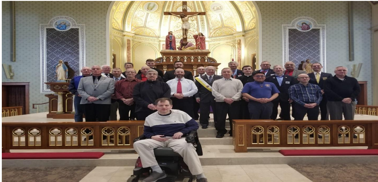
New Degree Ceremony – Wisconsin Dells – 3/1/2020